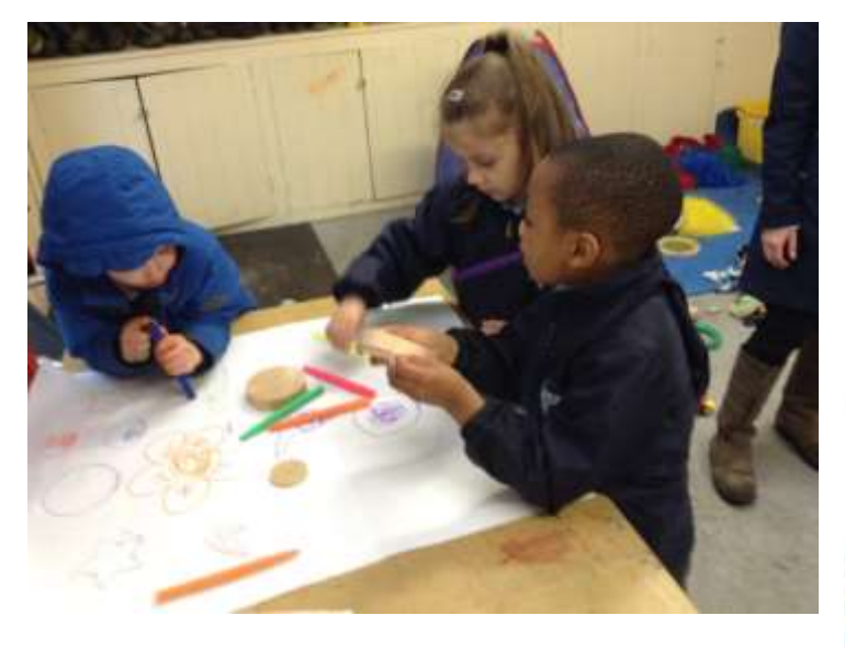
Exploring and drawing round wooden circles together.

Over the autumn term class 2 have had regular FS sessions. During this period they have had the opportunity to explore a variety of natural and manmade materials such as soil, sand water, wet and dry pasta clay/playdough, wood, leaves flowers, wool and string etc.