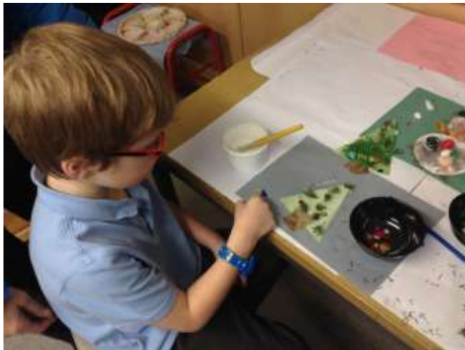
This tree has leaves.