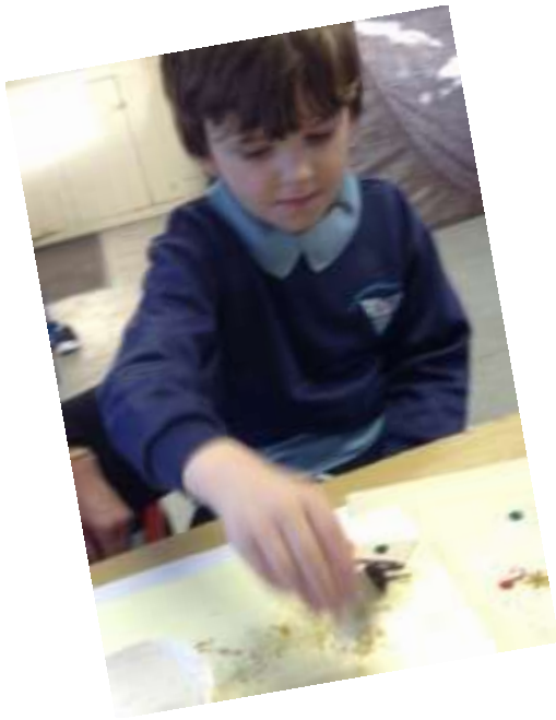
Time for some sparkly decorations. Well done boys.