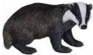
Baily painted a badger